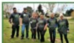
Volunteers from Jackson Family Wines