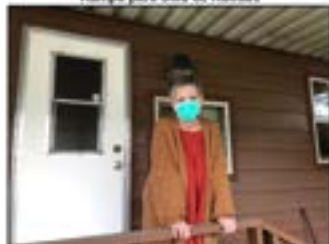
Después de Remodelación