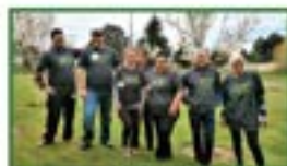
Voluntarios de Jackson Family Winery